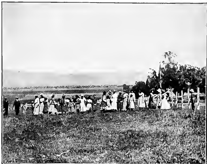
CHILDREN AT PLAY, FORT ROMIE.